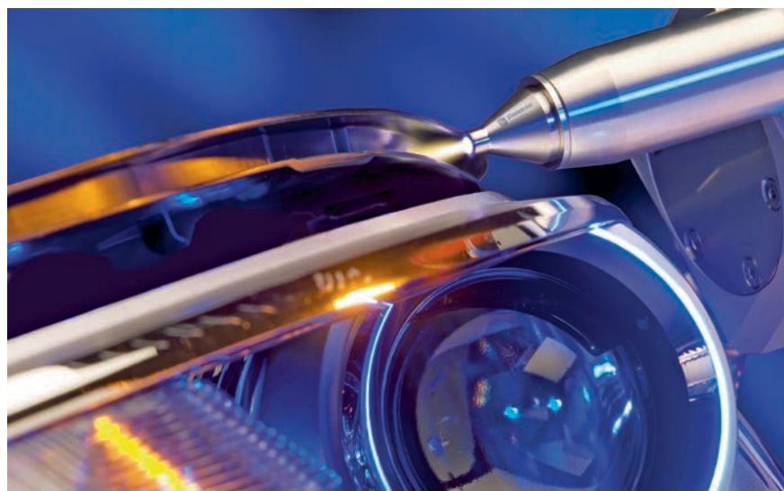
Fig. 1 > Vehicle headlamps must satisfy extremely strict sealing requirements. To prevent moisture penetrating the housing, the plastic grooves are cleaned and activated with atmospheric pressure plasma prior to bonding.

The first company to use the new plasma polymerization technology Plasma-