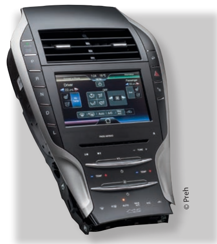
Fig. 2 > The polycarbonate panel on the center stack of the Ford Lincoln MKZ is pretreated with Openair plasma to obtain a bubble-free touch foil bond.

In 2008 Plasmatrete and the Fraunhofer IFAM announced the joint development and world's first industrial use of a functional plasma nanocoating under normal