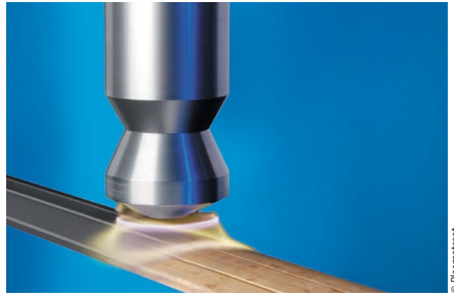
Fig. 4 > The Openair process facilitates the chrome-free pretreatment of aluminum profiles. An additional plasma polymerization coating is applied to profiles used on the vehicle exterior.

Plus was TRW Automotive (now ZF TRW), world market leader in the development of integrated safety systems for the automotive industry. The plasma technology is used here to prevent corrosion of die-cast aluminum motor-driven pump units. These units are integral components of servo steering systems for a multitude of vehicles and subject to high reliability requirements in regard to corrosion, thermal and spray water resistance.